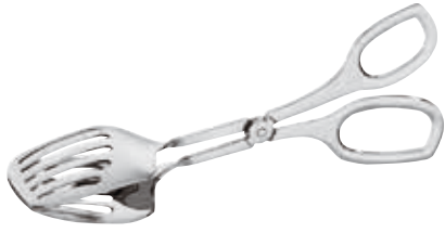
Vegetables pliers Pinza per verdure Salad-/Gemüsezange Pince à légumes Pinza verduras

52550-81 18-10 S/S 52750-81 Silverplated S/S