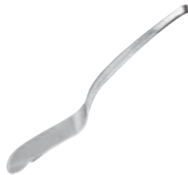
Butter spreader, set 6 pcs Spatolina per burro, set 6 pz Butterstreicher, 6 Stk. Tartineur, 6 pieces Palita mantequilla, 6 piezas

52550-37 18-10 S/S 52750-37 Silverplated S/S