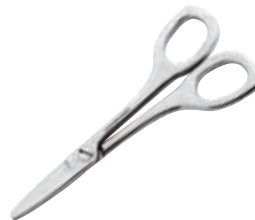
Grape scissor Forbice per uva Traubenschere Ciseaux raisin Tijeras uva

52550-91 18-10 S/S 52750-91 Silverplated S/S