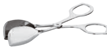
Pastry pliers Pinza per dolci Gebäckzange Pince à pâtisserie Pinza pasteles

-83 21 cm - 8¼ in. -84 26,5 cm - 10 7 / 16 in. -85 24 cm - 9 7 / 16 in.