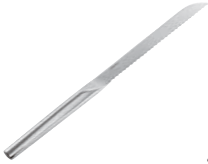
Panettone knife Coltello per panettone Panettonemesser Couteau à panettone Cuchillo de pan