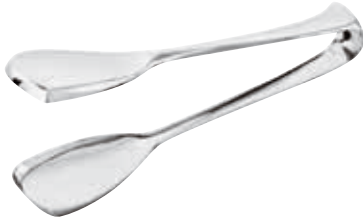
Bread / pastry tongs Molla per pane e pasticceria Brot / Gebäckzange Pince à pain et pâtisserie Pinza pan y pasteles

● 52750K73 PVD Copper ● 52750O73 PVD Gold