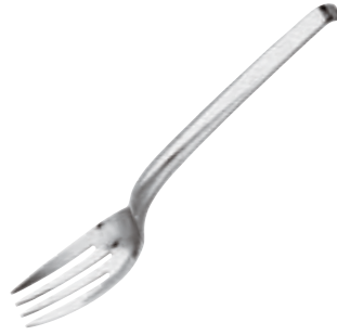
Serving fork Forchetta a servire Serviergabel Fourchette à servir Tenedor servir