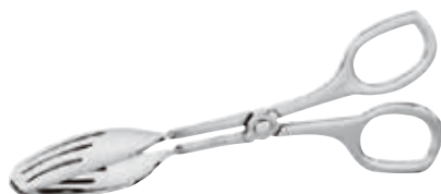
Hors d'oeuvres / pastry pliers Pinza per antipasti e dolci Vorspeisen / Pâtisseriezange Pince à hors-d'oeuvres et pâtisserie Pinza entremeses y pasteles