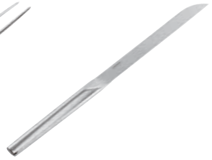
Roaste knife Coltello per arrosto Tranchiermesser Couteau à rôtis Cuchillo roast beef