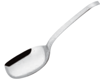
Rice spoon Cucchiaio per riso Reislöffel Cuiller à riz Cuchara arroz

52550-16 18-10 S/S 52750-16 Silverplated S/S