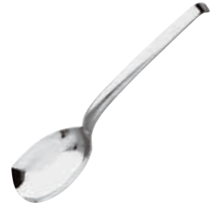
Serving spoon Cucchiaio a servire Servierlöffel Cuiller à servir Cuchara servir

● 52750K11 PVD Copper ● 52750O11 PVD Gold