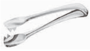
Sugar tongs Molla per zucchero Zuckerzange Pince à sucre Pinza azucar

52550-54 18-10 S/S 52750-54 Silverplated S/S