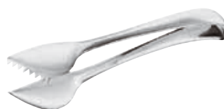
Ice tongs Molla ghiaccio Eiszange Pince à glace Pinza hielo

52550-55 18-10 S/S 52750-55 Silverplated S/S