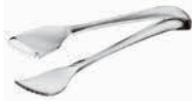
Sugar tongs Molla per zucchero Zuckerzange Pince à sucre Pinza azucar

52550-53 18-10 S/S 52750-53 Silverplated S/S