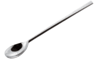
Ice tea spoon, set 6 pcs Cucchiaio bibita, Set 6 pz Limonadenlöffel, 6 Stk. Cuiller à soda, 6 pieces Cuchara refresco, 6 piezas

- 68 21 cm - 8 1 / 4 in. - 69 26 cm - 10 1 / 4 in. - 70 30 cm - 11 3 / 16 in.