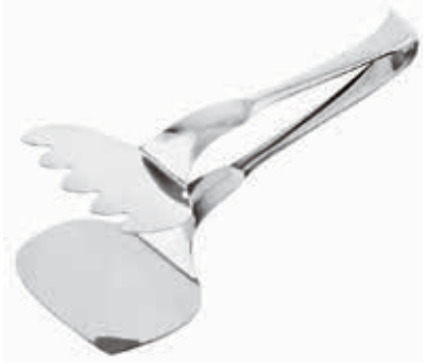
Multipurpose tongs Molla universale Universalzange Pince universelle Pinza universal

52550-58 18-10 S/S 52750-58 Silverplated S/S