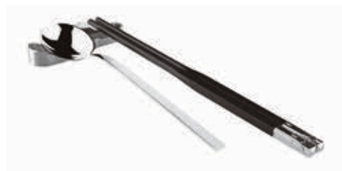
2 chopsticks, holder and spoon set Set 2 bacchette, poggia bacchette e cucchiaio Satz 2 Ess-Stäbchen, Ablage und Löffel Set 2 baguettes, pose baguettes et cuiller Conjunto 2 palillos, soporte y cuchara

56541-00 18-10 S/S 9 x 2,5 cm H 2 cm - 3 1/2 x 1 in. H 3/4 in.