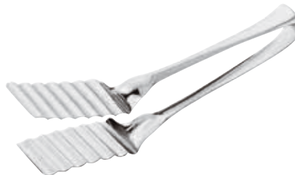
Asparagus tongs Molla per asparagi Spargelzange Pince à asperges Pinza espárragos

-62 18 cm - 7 1 / 8 in. -63 23 cm - 9 5 / 8 in. -64 26 cm - 10 1 / 4 in.