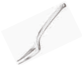
Escargot fork, set 6 pcs Forchetta per lumache, set 6 pz Schneckengabel, 6 Stk Fourchette à escargots, 6 pieces Tenedor caracoles, 6 piezas

52550-19 18-10 S/S 52750-19 Silverplated S/S