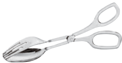
Serving pliers Pinza per servire Servierzange Pince à servir Pinza servir