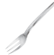
Oyster / cake fork, set 6 pcs Forchettina per ostriche/dolce, set 6 pz Kuchen-/Austerngabel, 6 Stk Fourchette à huitres/gâteau, 6 pieces Tenedor ostras/tarta, 6 piezas

52550-43 18-10 S/S 52750-43 Silverplated S/S