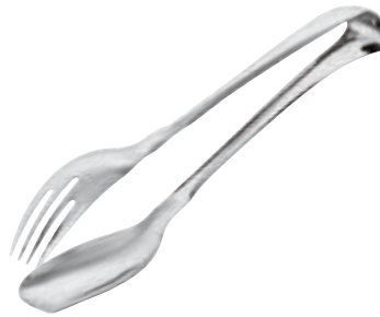
Vegetable / meat tongs Molla per carne e verdure Gemüse- /Fleischzange Pince à rôti Pinza asados y verduras