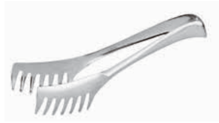
Spaghetti tongs Molla per spaghetti Spaghettizange Pince à spaghetti Pinza espagueti