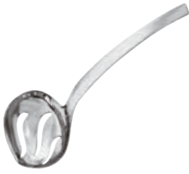
Perforated ladle Coppino salsa forato Schöpfer, gelocht Louche percée Cazo, perforado

52550-21 18-10 S/S 52750-21 Silverplated S/S