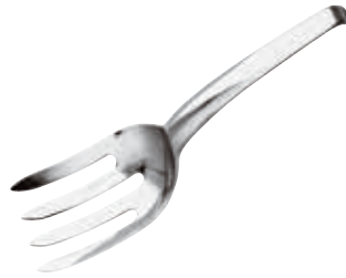
Spaghetti fork Forchettone per spaghetti Spaghettivorlegegabel Fourchette à servir spaghetti Tenedor servir espaguettis

-24 39 cm - 15½ in. -25 25,5 cm - 10 in. -26 30 cm - 11¾ in.