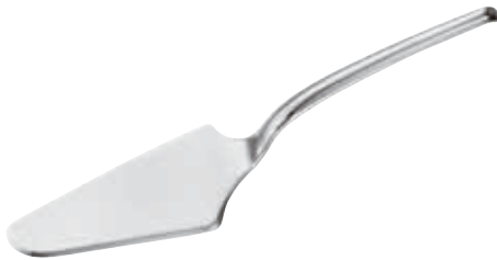
Cake server Pala torta Tortenheber Pelle à tarte Pala tarta

52550-02 18-10 S/S 52750-02 Silverplated S/S