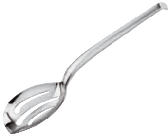
Perforated serving spoon Cucchiaio a servire forato Servierlöffel gelocht Cuiller à servir percée Cuchara servir perforada

● 52750K13 PVD Copper ● 52750O13 PVD Gold