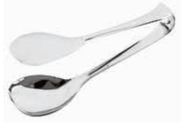
Fruit tongs Molla per frutta Obstzange Pince à fruits Pinza frutas

52550-50 18-10 S/S 52750-50 Silverplated S/S