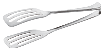
Toast / pastry tongs Molla per toast e dolci Toast / Gebäckzange Pince à toast et tarte Pinza pasteles y tostadas

-87 15 cm - 5 15 / 16 in. -89 20 cm - 7 7 / 8 in.