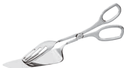
Pie pliers Pinza per torta Kuchenzange Pince à tarte Pinza pasteles

-77 21 cm - 8¼ in. -78 24 cm - 9 7 / 16 in. -79 30 cm - 11 13 / 16 in.