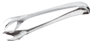
Ice tongs Molla per ghiaccio Eiszange Pince à glace Pinza hielo

52550-56 18-10 S/S 52750-56 Silverplated S/S ● 52750M56 PVD Parfait Amour ● 52750N56 PVD Cognac