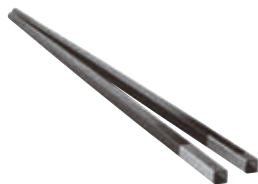
Chinese chopsticks Bacchette cinesi Essstäbchen Baguettes Palillos

56541-05 High quality synthetic material Materiale sintetico di alta qualità 25,70 cm - 10 7/8 in.